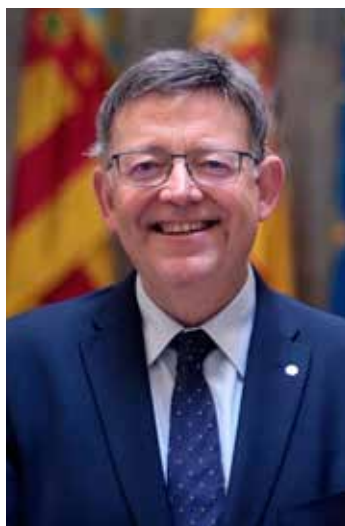
Ximo Puig President of Valencia