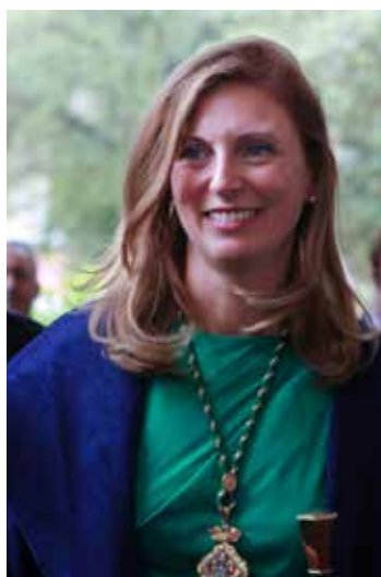
Amparo Marco Mayor of Castelló de la Plana

“In Badalona, women’s sport helps us build a city of values, respect and equality”