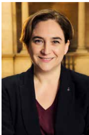
Ada Colau Mayor of Barcelona

“Barcelona loves sports and it works hard to make it a tool for social cohesion and equal opportunities”