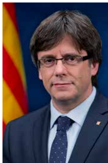
Carles Puigdemont President of Catalonia